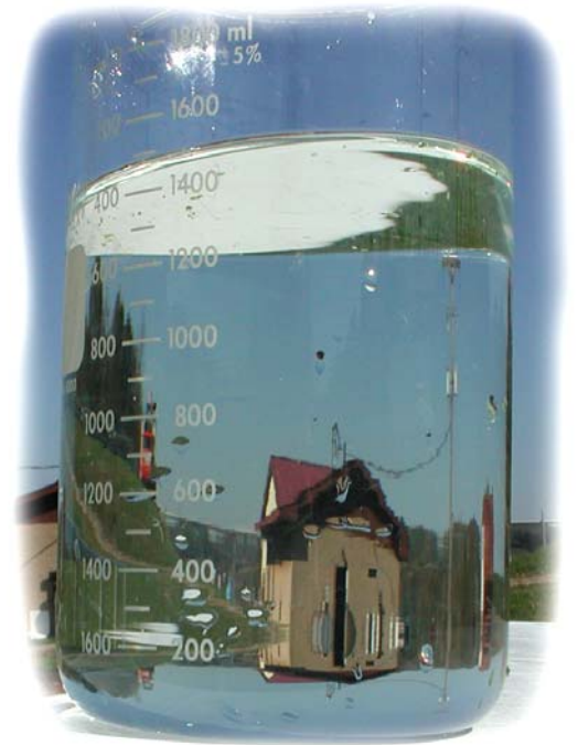
[above right] Actual final effluent discharge from Laurelville, Ohio WWTP... AquaMats® Process means results.

There is virtually no maintenance or operating cost burdens to AquaMats® once they have been installed for ammonia removal. The engineering of the surfaces discourage excess biofilm development. With AquaMats® microbes do the work naturally.